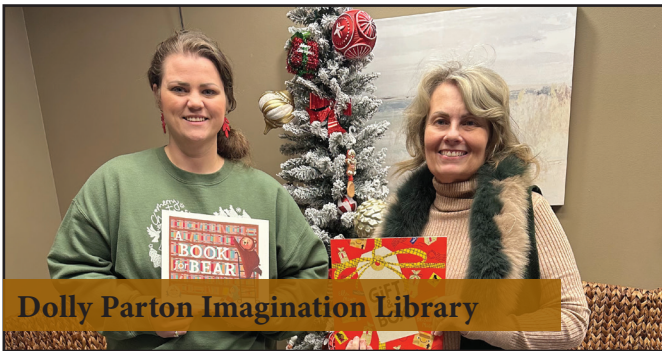
Dolly Parton Imagination Library