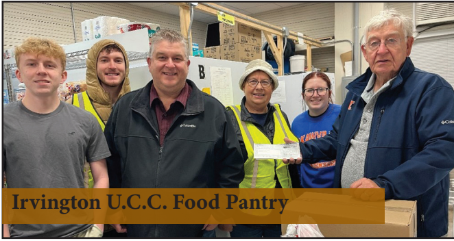
Irvington U.C.C. Food Pantry