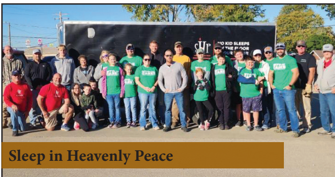
Sleep in Heavenly Peace