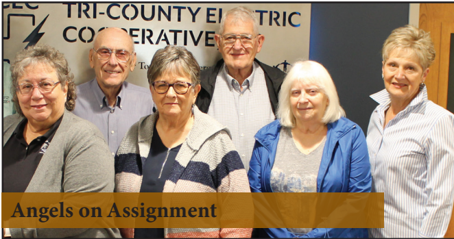
Angels on Assignment