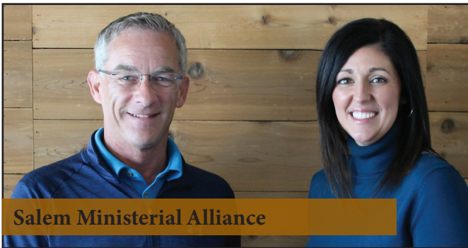
Salem Ministerial Alliance