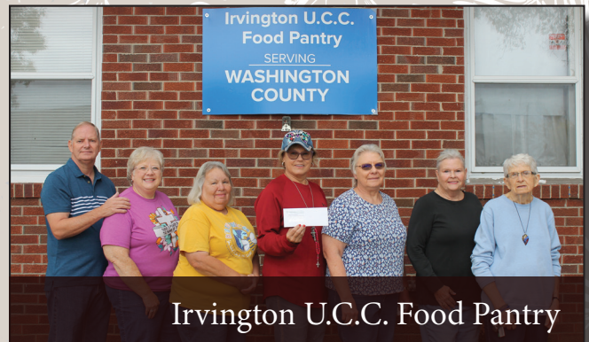
Irvington U.C.C. Food Pantry