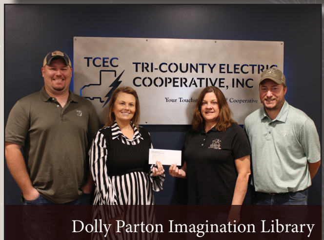
Dolly Parton Imagination Library