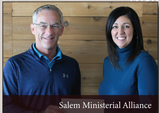
Salem Ministerial Alliance