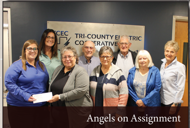
Angels on Assignment