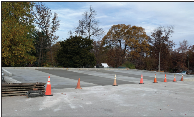
Above is a picture of the new terrace offering flat space to safely and accessibly store equipment for our linemen!

Our temporary location has worked out great, and we thank you for your patience during the transition! However, there is “no place like home”. We will be glad to settle back