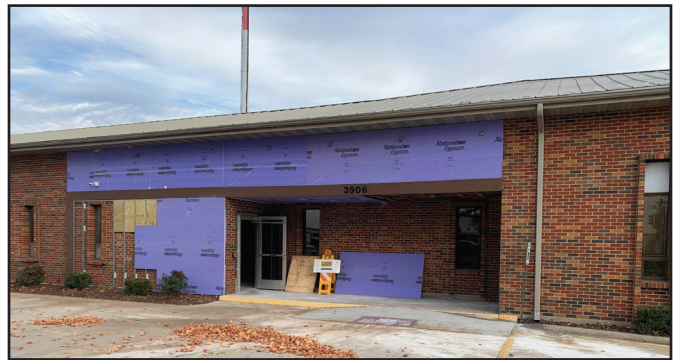
By the time you receive this month's newsletter, the front of the building will most likely be complete! Here is a photo during the reconstruction, which included masonry repairs and a facelift to our existing entrance.

Phase two will involve minor renovations in our Operations, Engineering, and Manager's Departments. This phase will be much shorter than phase one, and should only take four months.