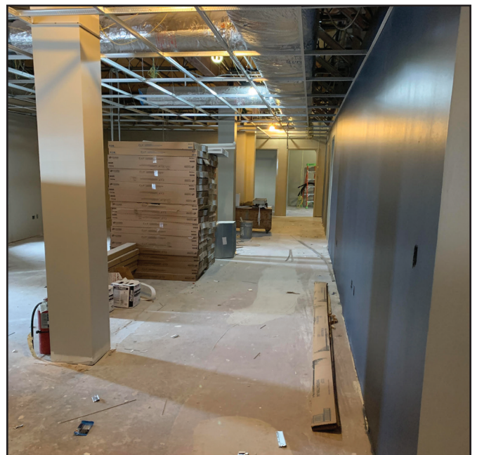
Billing Department Reconfiguration