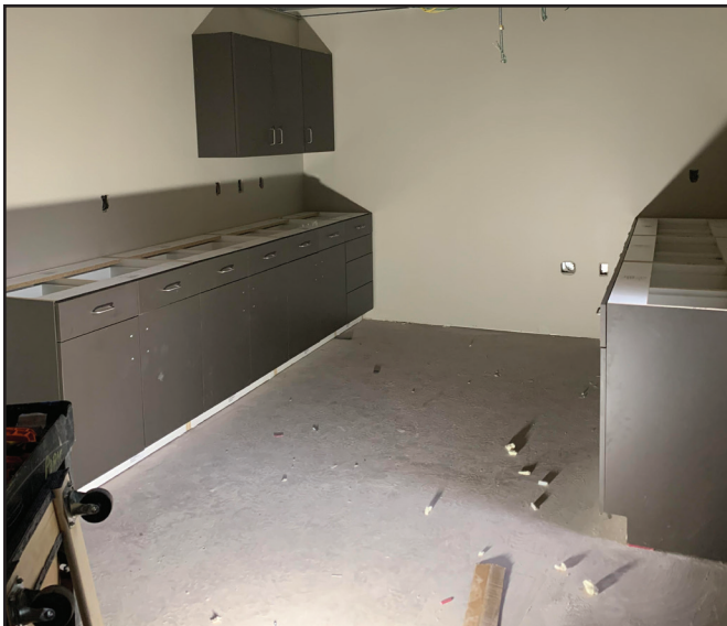
We now have a copy/print/mail room! Having all functions in one room will improve efficiency.

into our normal workspaces and welcome our members through the lobby door again!