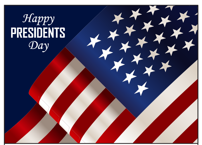
Tri-County Electric Cooperative Offices will be closed on Monday, February 17th in honor of President's Day.

Tri-County Electric Cooperative Annual Meeting